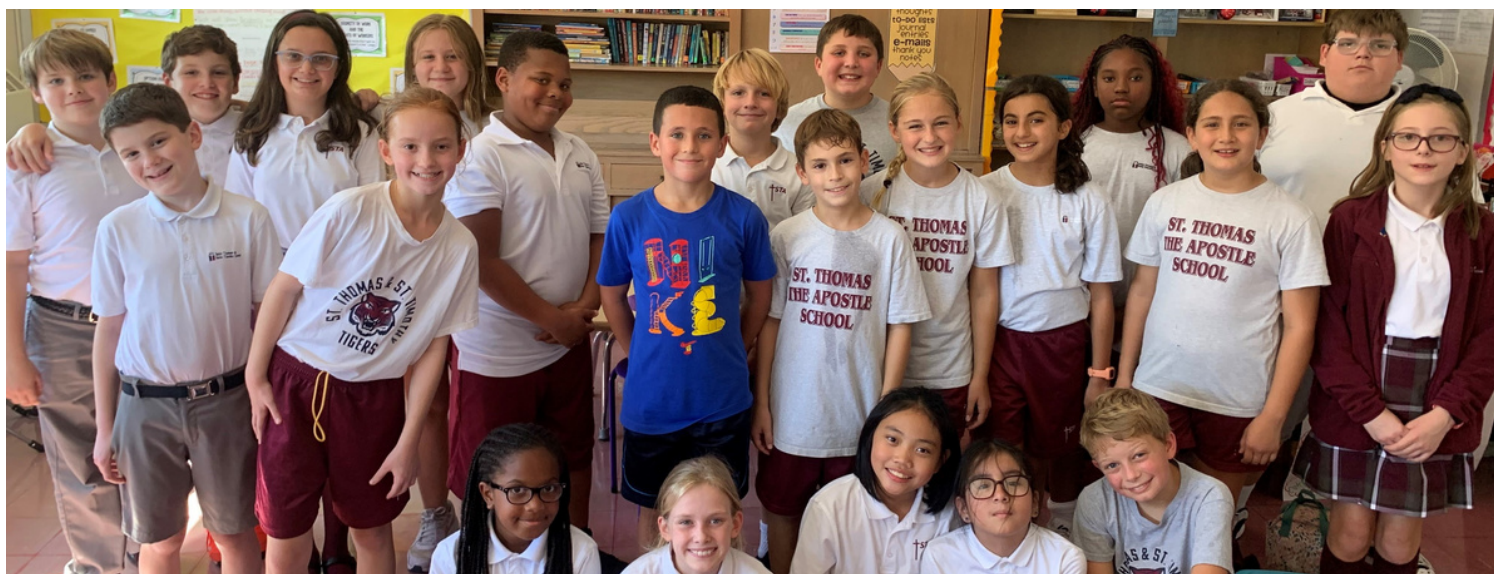
Congratulations to our 5th grade students for their successful transition.