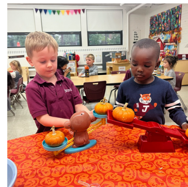
Our little pumpkins! Pre-K students learn about different weight during their math centers.

Winter Wear Drive: The Parish of St. Thomas & St. Timothy Social Action Committee will be holding a Winter Wear for Kids Drive! St. Timothy & St. Thomas School will be collecting winter items to donate to this drive; it is inspiring to see our students reaching out to help other children in need. Please consider helping to provide warmth, hope, and confidence to children who are in need of winter coats, mittens, hats, & boots. Click here for more information.