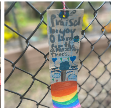
4th grade students decorated the community garden at St. Thomas with their beautiful artwork from their retreat this week.