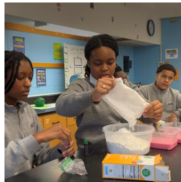
Hands on learning happening in 8th grade science!