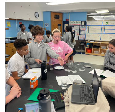
8th Grade students pose with shocked expressions at the results of their science experiments.