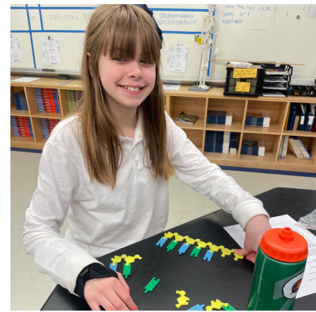
7th Grade students learn about DNA mutations by creating their own with chain links to understand how genetic variations affect traits.