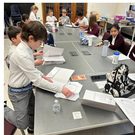
Student Ambassadors are busy at work, prepping for the upcoming Open House!

Foundation for the Advancement of Catholic Schools (FACS): Reminder - all applications must be completed and submitted to the school office by Monday, March 4th. The Scholarship Application, Guidelines and Criteria for each of the 2024-2025 scholarships is available on our website. Please click here to begin your review. Please indicate the scholarship(s) you are applying for on page 5 of your application.