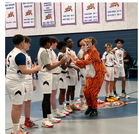
Our Tiger Mascot came to celebrate "Senior Night" with our 8th grade student athletes. Go Tigers!