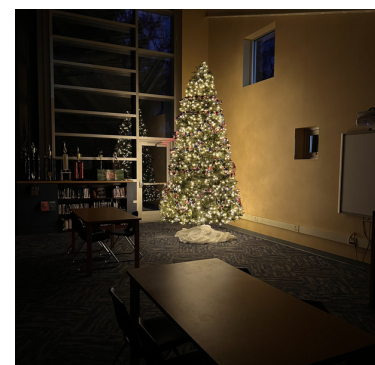
It's beginning to look a lot like Christmas...