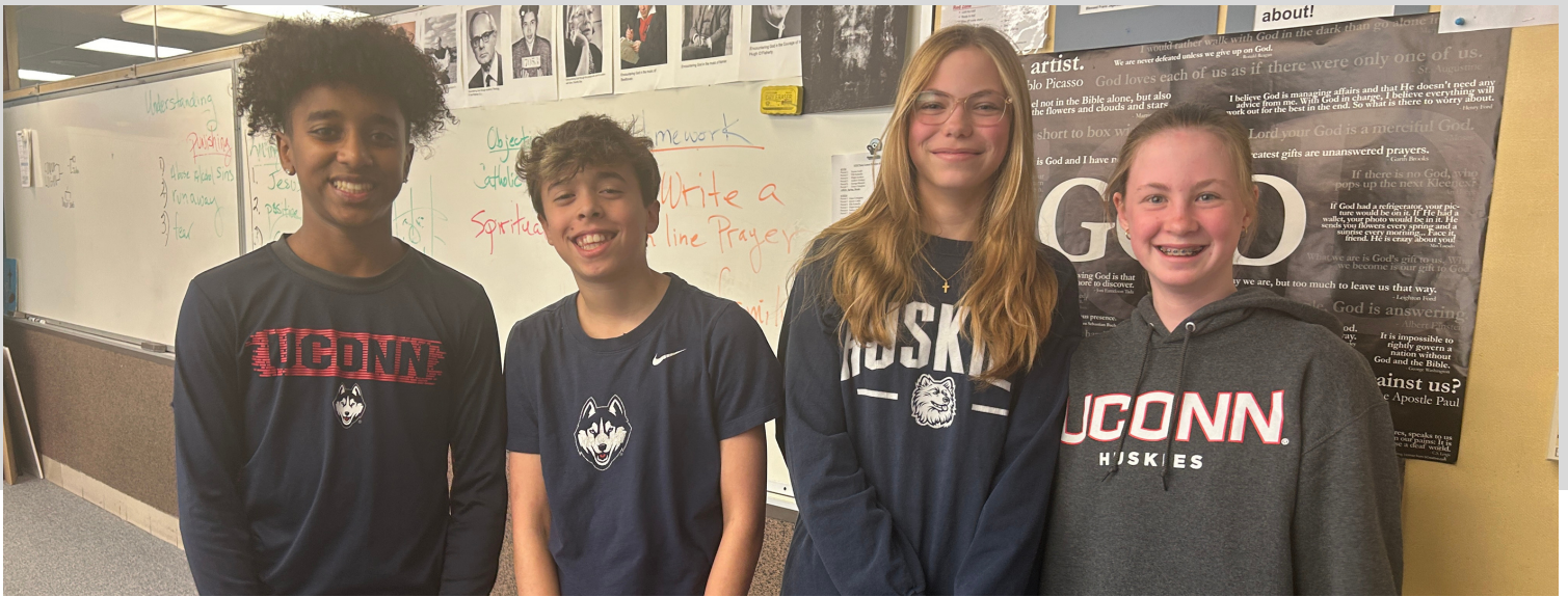
8th Grade students enjoyed their UCONN themed dress down day today!